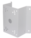
SN-BK340A Corner Mount