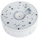
SN-CBK645A Junction Box